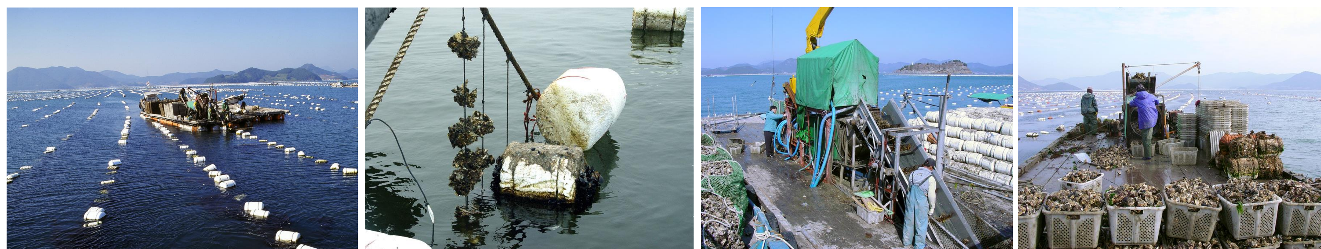
Suspended long-line culture system in oyster grow-out fields and harvesting oysters using an automatic oyster-string processor